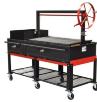
(shown with Brasero Coal Starter)