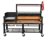
(shown with Brasero Coal Starter)