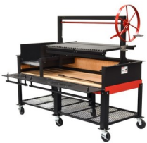
(shown with Brasero Coal Starter)