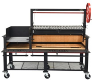
(shown with Brassero Coal Starter)