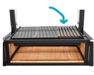
Carbon Steel V-channel 8 1/2" grill grate Also available in 10" & 14" sizes—speak to sales (Will fit alongside laser cut grates, griddle or paella kit)